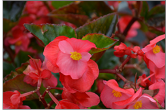
Big Rose Green Leaf Begonia flowers