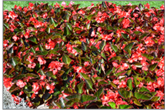
Big Red Bronze Leaf Begonia in bloom

Big Red Bronze Leaf Begonia is a fine choice for the garden, but it is also a good selection for planting in outdoor containers and hanging baskets. It is often used as a 'filler' in the 'spiller-thriller-filler' container combination, providing a mass of flowers and foliage against which the larger thriller plants stand out. Note that when growing plants in outdoor containers and baskets, they may require more frequent waterings than they would in the yard or garden.