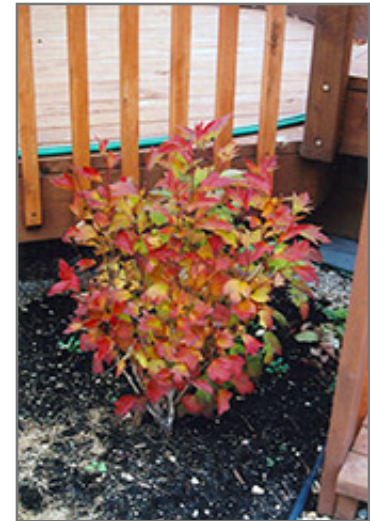
Compact Highbush Cranberry in fall