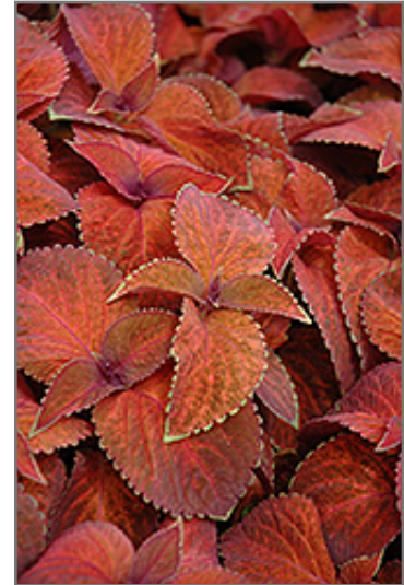
Wizard Sunset Coleus foliage

Wizard Sunset Coleus is recommended for the following landscape applications;