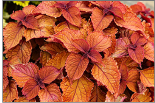
Wall Street Coleus foliage