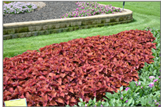
Wall Street Coleus