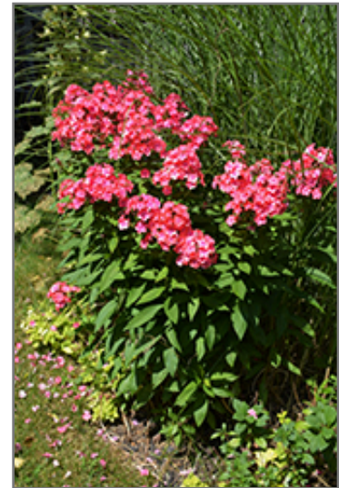
Flame Coral Garden Phlox in bloom