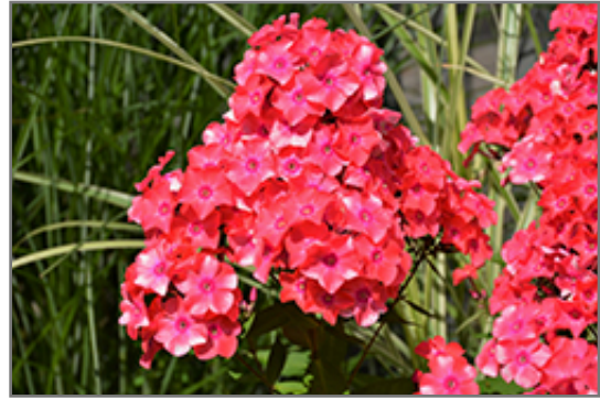
Flame Coral Garden Phlox flowers