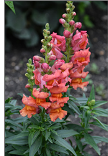
Speedy Sonnet Bronze Snapdragon flowers

Speedy Sonnet Bronze Snapdragon is recommended for the following landscape applications;