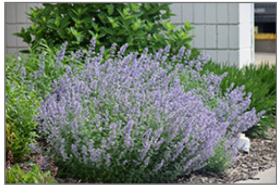
Cat's Meow Catmint in bloom