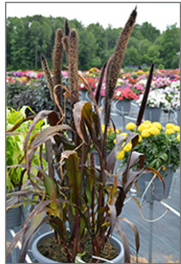
Purple Baron Millet in bloom