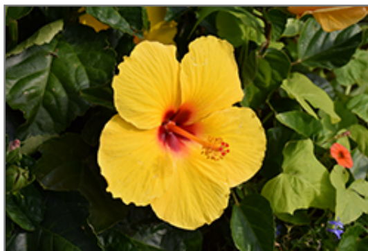
Sunny Wind Hibiscus flowers

This plant is native to the tropics and prefers growing in moist environments with evenly warm conditions all year round. In our climate, it is usually grown as an outdoor annual in the garden or in a container. If you want it to survive the winter, it can be brought in to the house and provided with special care, and then returned to the garden the following season. In its preferred tropical habitat, it can grow to be around 6 feet tall at maturity, with a spread of 6 feet. However, when grown as an annual or when overwintered indoors, it can be expected to perform differently, and its exact height and spread will depend on many factors; you may wish to consult with our experts as to how it might perform in your specific application and growing conditions.