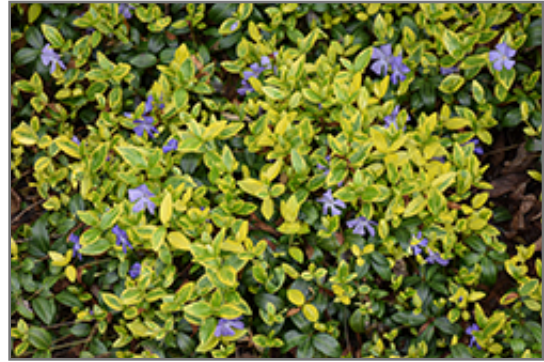
Illumination Periwinkle in bloom