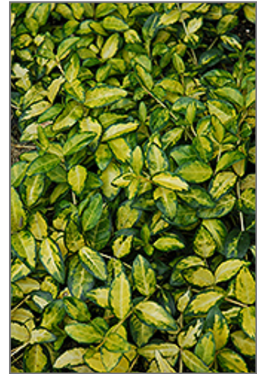
Illumination Periwinkle foliage