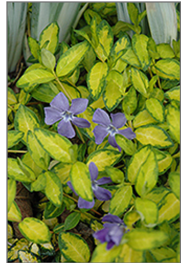
Illumination Periwinkle flowers

Illumination Periwinkle is a fine choice for the garden, but it is also a good selection for planting in outdoor pots and containers. Because of its spreading habit of growth, it is ideally suited for use as a 'spiller' in the 'spiller-thriller-filler' container combination; plant it near the edges where it can spill gracefully over the pot. Note that when growing plants in outdoor containers and baskets, they may require more frequent waterings than they would in the yard or garden.