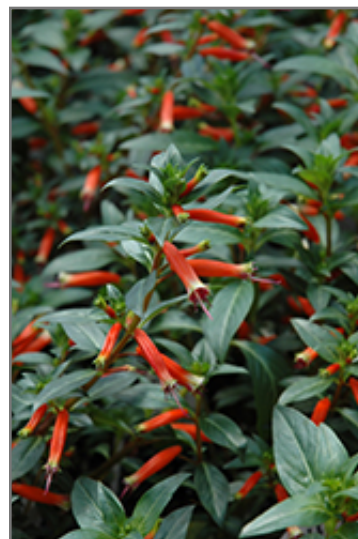
Vermillionaire Large Firecracker Plant flowers

Vermillionaire Large Firecracker Plant is a fine choice for the garden, but it is also a good selection for planting in outdoor pots and containers. With its upright habit of growth, it is best suited for use as a 'thriller' in the 'spiller-thriller-filler' container combination; plant it near the center of the pot, surrounded by smaller plants and those that spill over the edges. It is even sizeable enough that it can be grown alone in a suitable container. Note that when growing plants in outdoor containers and baskets, they may require more frequent waterings than they would in the yard or garden.