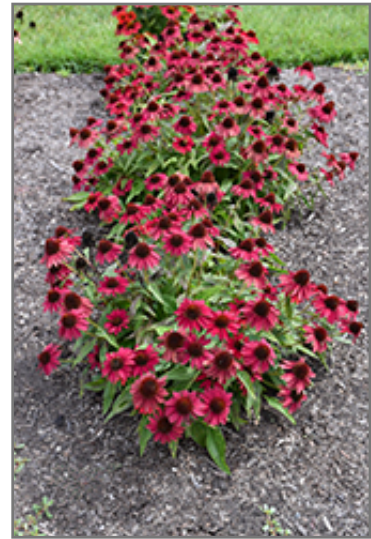
Sombrero Baja Burgundy Coneflower in bloom