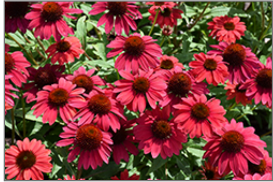
Sombrero Baja Burgundy Coneflower flowers

This is a relatively low maintenance plant, and is best cleaned up in early spring before it resumes active growth for the season. It is a good choice for attracting butterflies to your yard, but is not particularly attractive to deer who tend to leave it alone in favor of tastier treats. It has no significant negative characteristics.