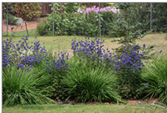
Common Monkshood in bloom

Common Monkshood will grow to be about 3 feet tall at maturity extending to 4 feet tall with the flowers, with a spread of 24 inches. It tends to be leggy, with a typical clearance of 1 foot from the ground, and should be underplanted with lower-growing perennials. The flower stalks can be weak and so it may require staking in exposed sites or excessively rich soils. It grows at a medium rate, and under ideal conditions can be expected to live for approximately 15 years. As an herbaceous perennial, this plant will usually die back to the crown each winter, and will regrow from the base each spring. Be careful not to disturb the crown in late winter when it may not be readily seen!