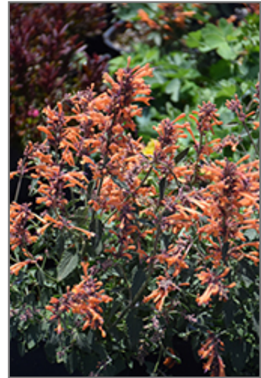
Kudos Mandarin Hyssop flowers