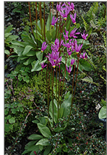
Shooting Star in bloom