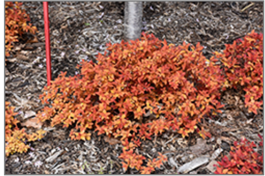
Double Play Candy Corn Spirea

This shrub should only be grown in full sunlight. It prefers to grow in average to moist conditions, and shouldn't be allowed to dry out. It is not particular as to soil type or pH. It is highly tolerant of urban pollution and will even thrive in inner city environments. This is a selected variety of a species not originally from North America.