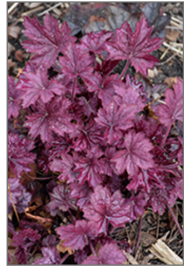
Wild Rose Coral Bells foliage