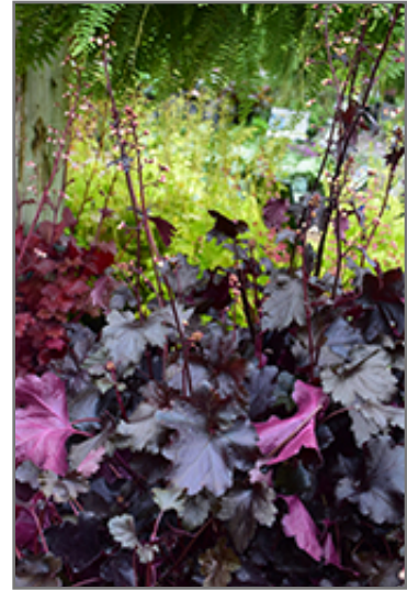
Black Pearl Coral Bells in bloom

Black Pearl Coral Bells is recommended for the following landscape applications;