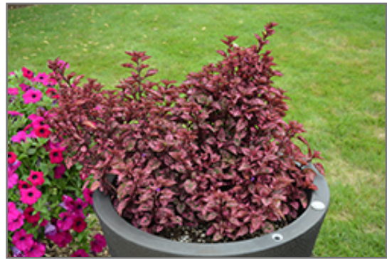
Hippo Rose Polka Dot Plant