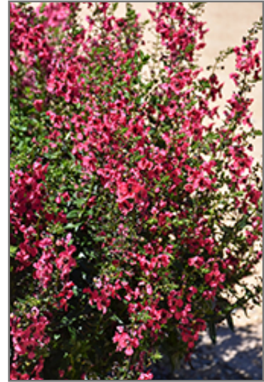
Archangel Cherry Red Angelonia flowers

Archangel Cherry Red Angelonia is an herbaceous annual with an upright spreading habit of growth. Its relatively fine texture sets it apart from other garden plants with less refined foliage.