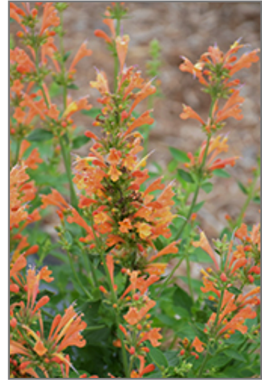
Poquito Orange Hyssop flowers

Poquito Orange Hyssop is a fine choice for the garden, but it is also a good selection for planting in outdoor pots and containers. It is often used as a 'filler' in the 'spiller-thriller-filler' container combination, providing a mass of flowers against which the larger thriller plants stand out. Note that when growing plants in outdoor containers and baskets, they may require more frequent waterings than they would in the yard or garden.