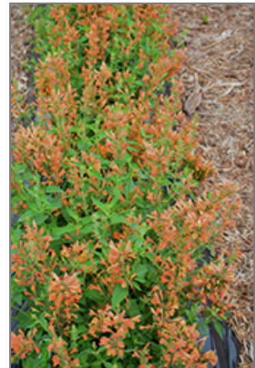
Poquito Orange Hyssop in bloom