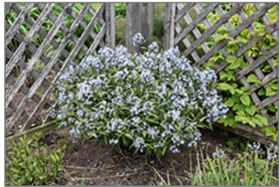
Storm Cloud Bluestar in bloom