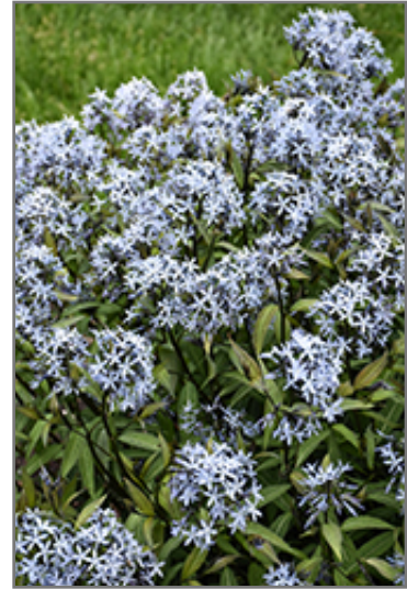
Storm Cloud Bluestar flowers

This is a relatively low maintenance plant, and should be cut back in late fall in preparation for winter. Deer don't particularly care for this plant and will usually leave it alone in favor of tastier treats. It has no significant negative characteristics.