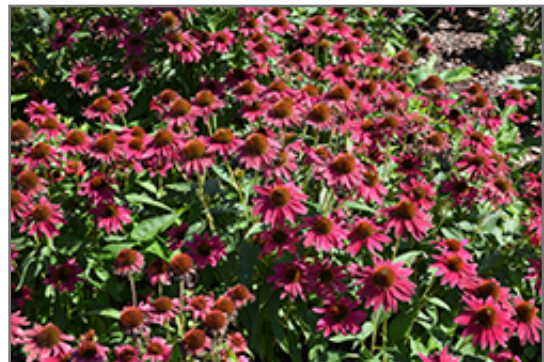
Sombrero Tres Amigos Coneflower in bloom