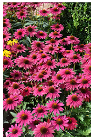
Sombrero Tres Amigos Coneflower flowers

Sombrero Tres Amigos Coneflower is a fine choice for the garden, but it is also a good selection for planting in outdoor pots and containers. With its upright habit of growth, it is best suited for use as a 'thriller' in the 'spiller-thriller-filler' container combination; plant it near the center of the pot, surrounded by smaller plants and those that spill over the edges. Note that when growing plants in outdoor containers and baskets, they may require more frequent waterings than they would in the yard or garden.