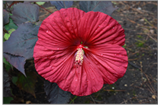
Summerific Holy Grail Hibiscus flowers

Summerific Holy Grail Hibiscus is an herbaceous perennial with an upright spreading habit of growth. Its relatively coarse texture can be used to stand it apart from other garden plants with finer foliage.