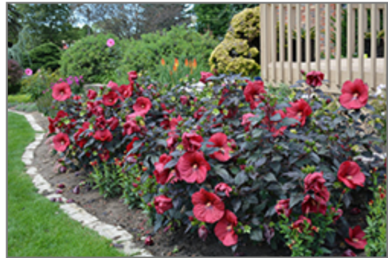
Summerific Holy Grail Hibiscus in bloom