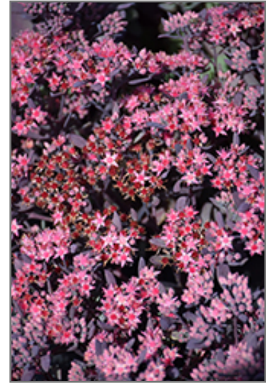
Plum Dazzled Stonecrop flowers

Plum Dazzled Stonecrop is a dense herbaceous perennial with an upright spreading habit of growth. Its medium texture blends into the garden, but can always be balanced by a couple of finer or coarser plants for an effective composition.