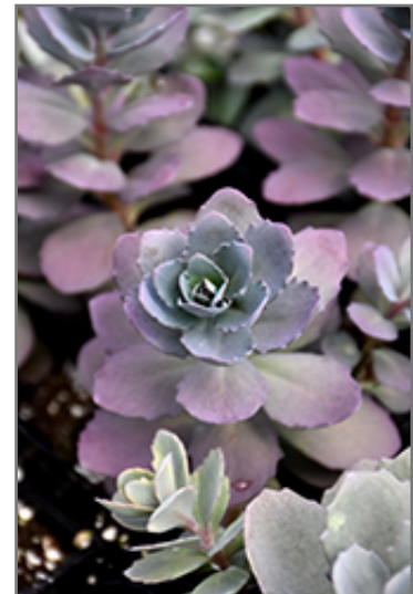
Plum Dazzled Stonecrop foliage