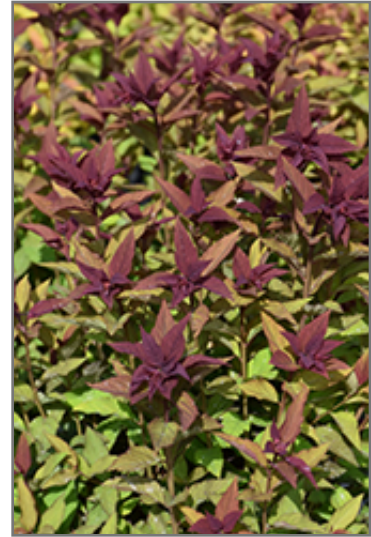
Double Play Doozie Spirea foliage

This shrub should only be grown in full sunlight. It prefers to grow in average to moist conditions, and shouldn't be allowed to dry out. It is not particular as to soil type or pH. It is highly tolerant of urban pollution and will even thrive in inner city environments. This particular variety is an interspecific hybrid.