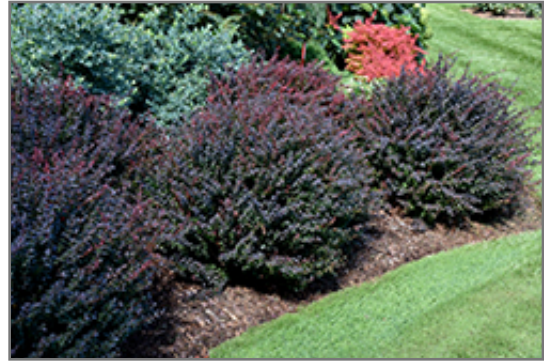
Sunjoy Mini Maroon Japanese Barberry

Sunjoy Mini Maroon Japanese Barberry is recommended for the following landscape applications;