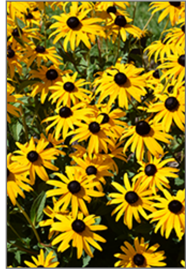
Goldsturm Coneflower flowers