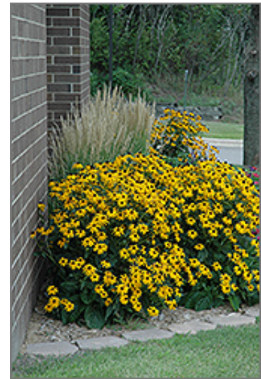
Goldsturm Coneflower in bloom