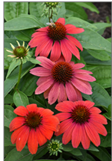
Artisan Red Ombre Coneflower flowers