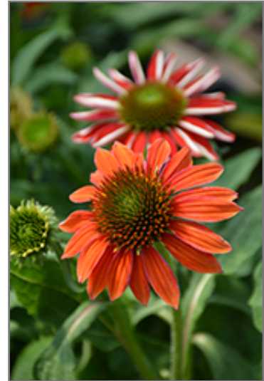
Artisan Red Ombre Coneflower flowers

Artisan Red Ombre Coneflower is recommended for the following landscape applications;