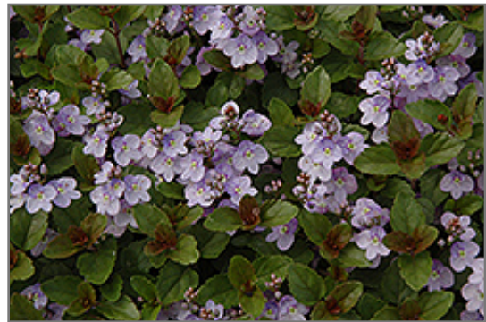
Waterperry Blue Speedwell flowers