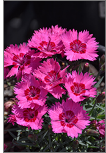
Paint The Town Fancy Pinks flowers

Paint The Town Fancy Pinks is a fine choice for the garden, but it is also a good selection for planting in outdoor pots and containers. It is often used as a 'filler' in the 'spiller-thriller-filler' container combination, providing a mass of flowers and foliage against which the thriller plants stand out. Note that when growing plants in outdoor containers and baskets, they may require more frequent waterings than they would in the yard or garden.