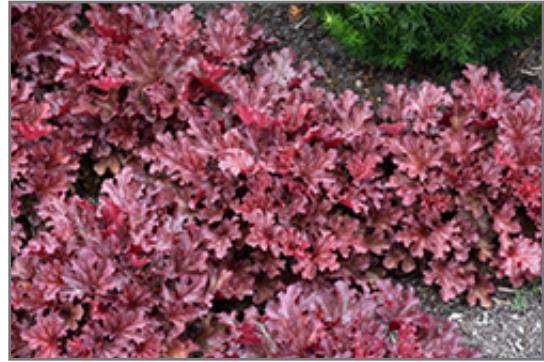
Ruby Tuesday Coral Bells

This is a relatively low maintenance plant, and should be cut back in late fall in preparation for winter. It is a good choice for attracting hummingbirds to your yard. It has no significant negative characteristics.