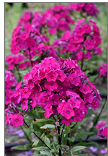
Super Ka-Pow Fuchsia Garden Phlox flowers