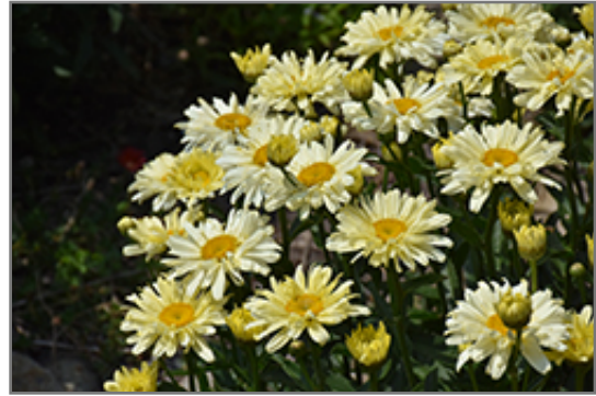
Amazing Daisies Banana Cream II Shasta Daisy flowers

Amazing Daisies Banana Cream II Shasta Daisy is an herbaceous perennial with an upright spreading habit of growth. Its medium texture blends into the garden, but can always be balanced by a couple of finer or coarser plants for an effective composition.