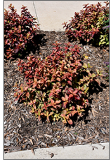
Midnight Sun Reblooming Weigela

Midnight Sun Reblooming Weigela makes a fine choice for the outdoor landscape, but it is also well-suited for use in outdoor pots and containers. It is often used as a 'filler' in the 'spiller-thriller-filler' container combination, providing a mass of flowers and foliage against which the thriller plants stand out. Note that when grown in a container, it may not perform exactly as indicated on the tag - this is to be expected. Also note that when growing plants in outdoor containers and baskets, they may require more frequent waterings than they would in the yard or garden.