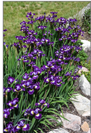
Jewelled Crown Siberian Iris in bloom