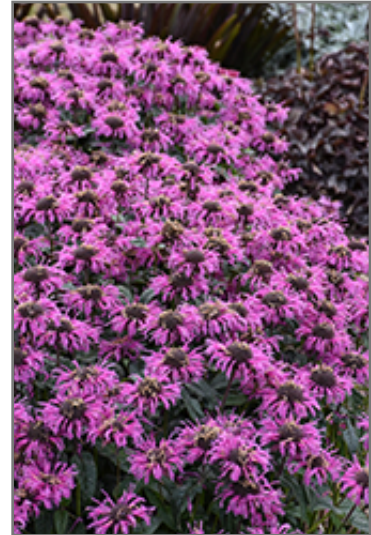
Upscale Lavender Taffeta Beebalm flowers

This plant will require occasional maintenance and upkeep, and should be cut back in late fall in preparation for winter. It is a good choice for attracting bees, butterflies and hummingbirds to your yard, but is not particularly attractive to deer who tend to leave it alone in favor of tastier treats. Gardeners should be aware of the following characteristic(s) that may warrant special consideration;