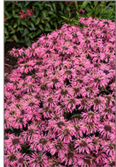
Upscale Pink Chenille Beebalm flowers

Upscale Pink Chenille Beebalm is an herbaceous perennial with a mounded form. Its medium texture blends into the garden, but can always be balanced by a couple of finer or coarser plants for an effective composition.