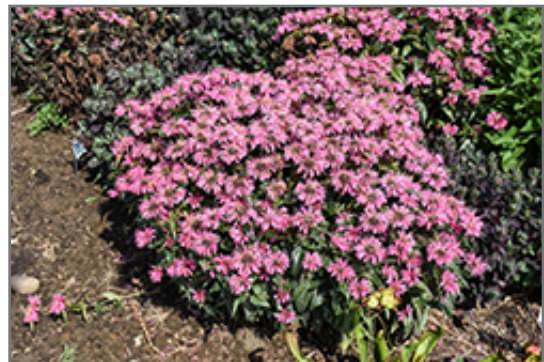
Upscale Pink Chenille Beebalm in bloom