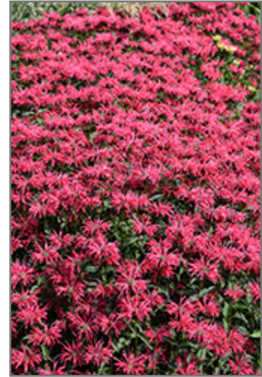
Upscale Red Velvet Beebalm flowers

Upscale Red Velvet Beebalm is a fine choice for the garden, but it is also a good selection for planting in outdoor pots and containers. Because of its height, it is often used as a 'thriller' in the 'spiller-thriller-filler' container combination; plant it near the center of the pot, surrounded by smaller plants and those that spill over the edges. It is even sizeable enough that it can be grown alone in a suitable container. Note that when growing plants in outdoor containers and baskets, they may require more frequent waterings than they would in the yard or garden.