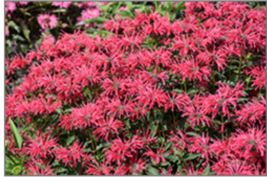
Upscale Red Velvet Beebalm flowers

Upscale Red Velvet Beebalm is an herbaceous perennial with a mounded form. Its medium texture blends into the garden, but can always be balanced by a couple of finer or coarser plants for an effective composition.