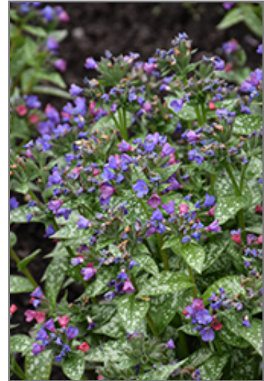
Spot On Lungwort

Spot On Lungwort is recommended for the following landscape applications;