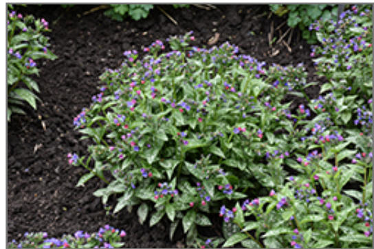
Spot On Lungwort in bloom