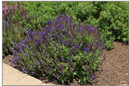
Noble Knight Sage in bloom