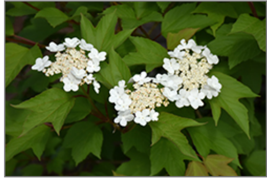
Redwing Highbush Cranberry flowers

Redwing Highbush Cranberry is a dense multi-stemmed deciduous shrub with an upright spreading habit of growth. Its average texture blends into the landscape, but can be balanced by one or two finer or coarser trees or shrubs for an effective composition.