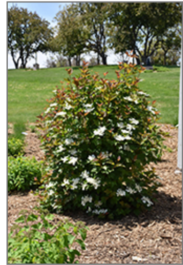
Redwing Highbush Cranberry in bloom