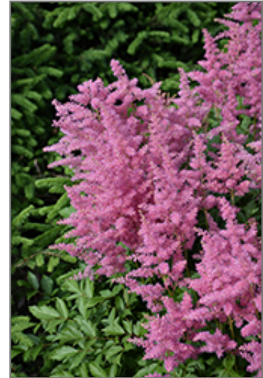
Visions in Pink Chinese Astilbe flowers

Visions in Pink Chinese Astilbe is recommended for the following landscape applications;