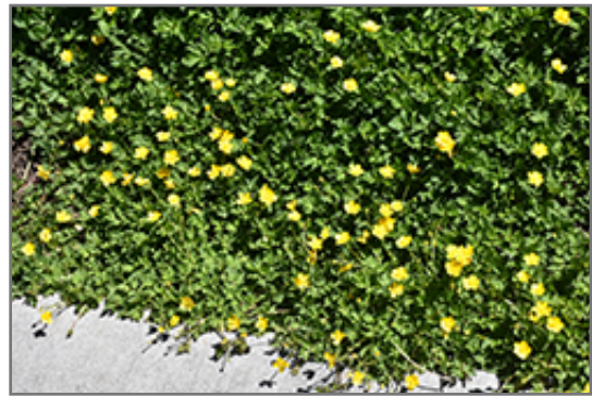
Barren Strawberry in bloom