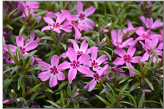
Crimson Beauty Moss Phlox flowers