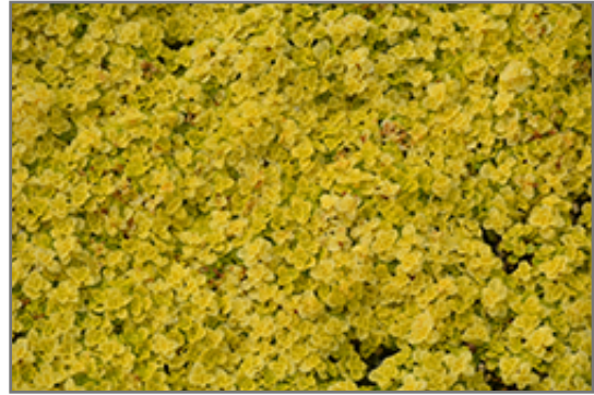
Golden Stonecrop foliage

Golden Stonecrop is recommended for the following landscape applications;