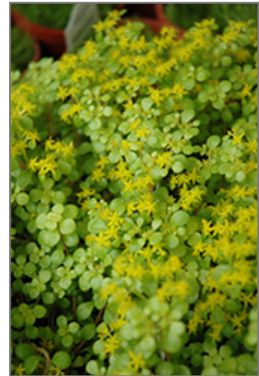
Golden Stonecrop flowers

This plant does best in full sun to partial shade. It prefers dry to average moisture levels with very well-drained soil, and will often die in standing water. It is considered to be drought-tolerant, and thus makes an ideal choice for a low-water garden or xeriscape application. It is not particular as to soil pH, but grows best in poor soils, and is able to handle environmental salt. It is highly tolerant of urban pollution and will even thrive in inner city environments. This is a selected variety of a species not originally from North America. It can be propagated by division; however, as a cultivated variety, be aware that it may be subject to certain restrictions or prohibitions on propagation.