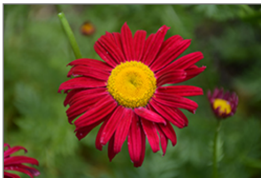
Robinson's Red Painted Daisy flowers

This is a relatively low maintenance plant, and should be cut back in late fall in preparation for winter. It is a good choice for attracting butterflies to your yard, but is not particularly attractive to deer who tend to leave it alone in favor of tastier treats. It has no significant negative characteristics.