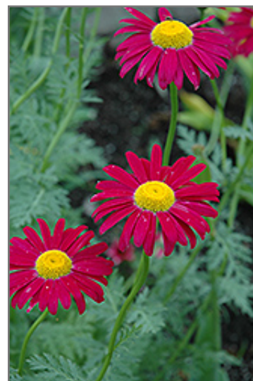
Robinson's Red Painted Daisy flowers