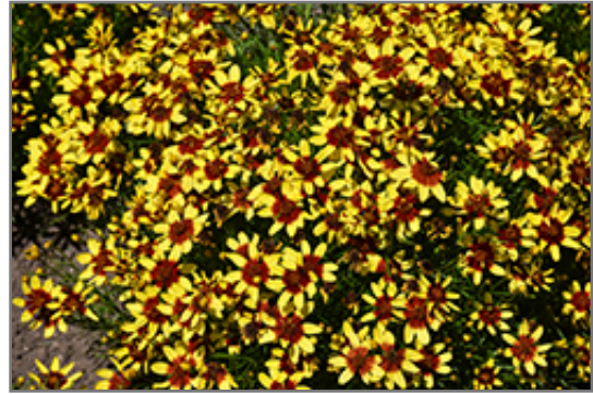
Firefly Tickseed flowers

Firefly Tickseed is recommended for the following landscape applications;